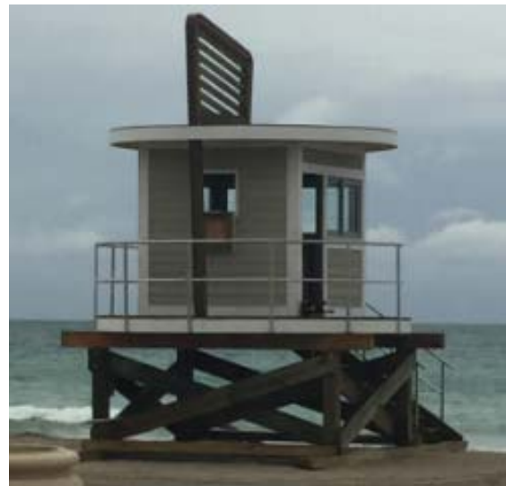
Scott Street First Aid Station