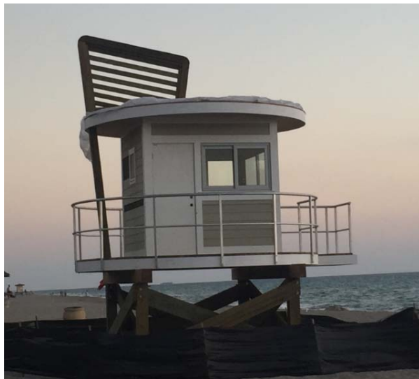
Azalea Terrace First Aid Station

PROJECT COMPLETION AND FINAL ACCEPTANCE BY THE CRA DEC 2019