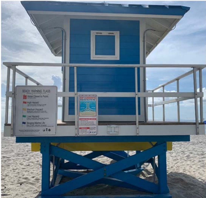
Lifeguard Tower Safety Signage